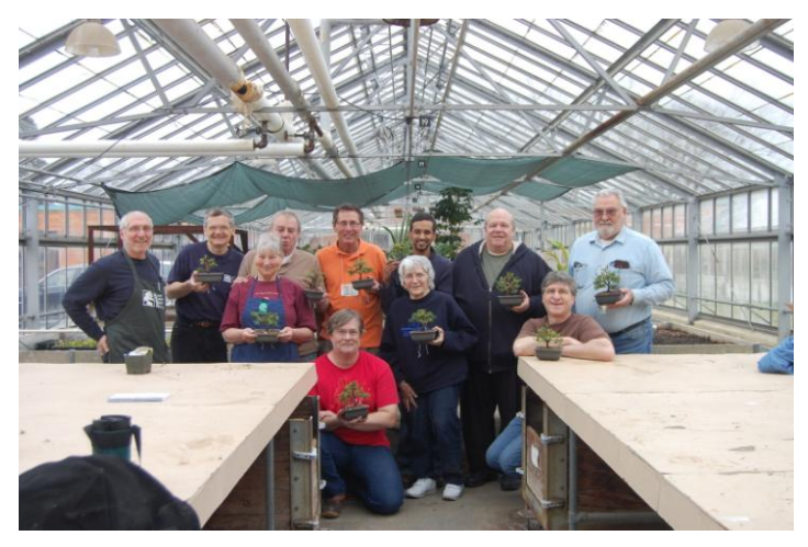
becomes available. AABS club members in MBG conservatory

The Ann Arbor Bonsai Society is sponsoring a Beginners Bonsai Class held at Matthaei Botanical Gardens. The class is separated into five sessions, all taking place on Saturday mornings, 10 AM to 12 Noon . Each of the five classes will be lead by experienced and knowledgeable members of the AABS. The classes are scheduled for March 24, April 28, May 12, June 16 and July 7 . During the classes the participants will receive two trees to work on, a deciduous and a tropical tree. Although there is no fee for the class, the two trees will cost approximately $70, the actual price will be determined when the material